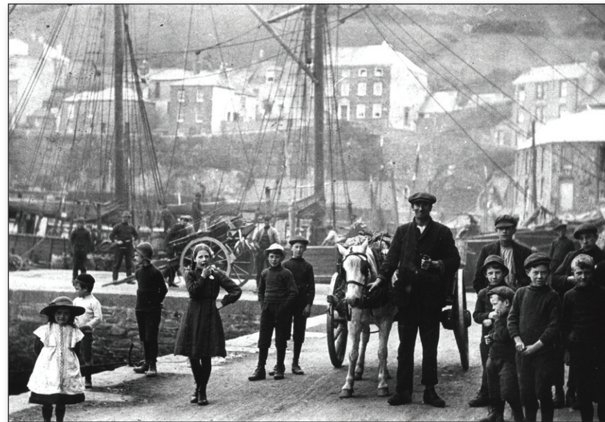
Mevagissey Quay, 1913