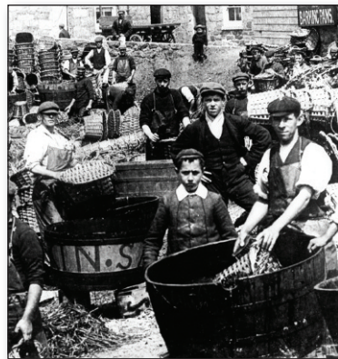
Newlyn, c. 1900