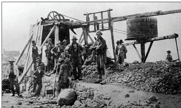
Right: Mining in the 1850s