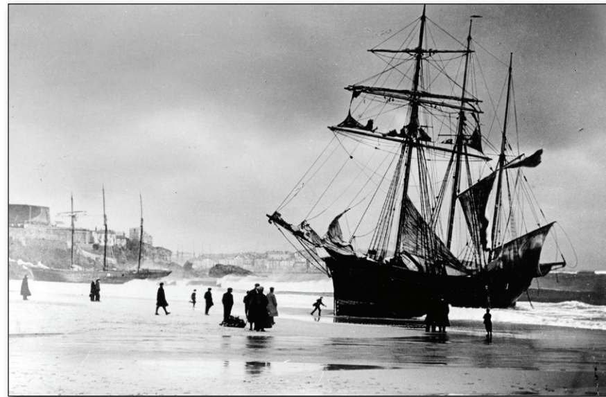
St Ives Shipwreck, 1908