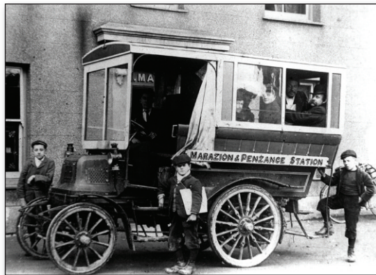
All Aboard! Marazion, 1902