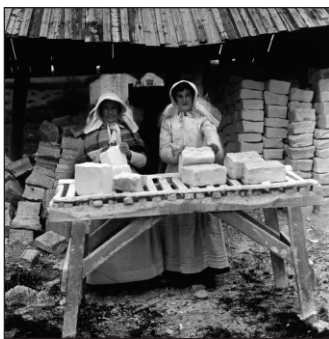
Example of a double-page spread.